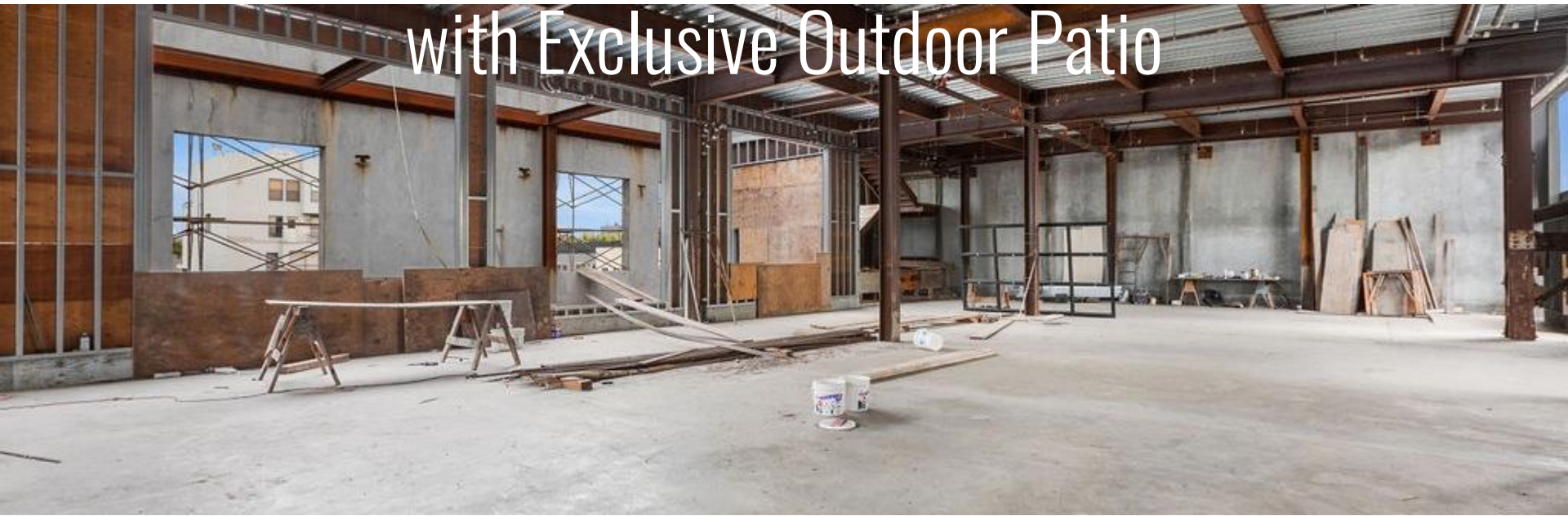
with Exclusive Outdoor Patio